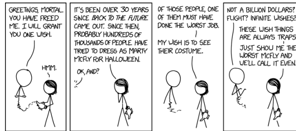
Figure 1.1.3 A suspect use of the Well-Ordering Principle.

We will use this principle throughout the text, next in Theorem 1.2.5 .